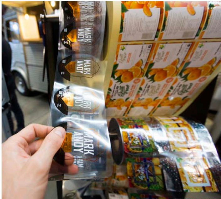
Fully variable printing: The Digital Series HD can print thousands of labels per minute, and each label can be different and at variable places on the web.

VDP jobs. As the Digital Series press was being developed, Mark Andy quickly realized that a highly capable RIP, hardware and software suite were required to process VDP jobs sufficiently fast to avoid press shut downs due to a lack of RIPped VDP work loaded on the digital press job queue.