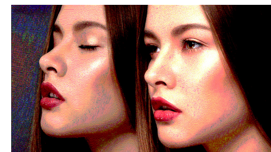
These microscopic effects cause visible artifacts, often described as mottling