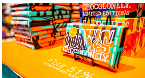
Tony Chocolonely Chocolate bars - each one unique - created using HP Mosaic technology and printed on the HP Indigo 12000 digital press

the bill of materials, and to render artwork exactly as the graphic designer or brand manager intended, is unparalleled. By the time Labelexpo Europe 2019 came along, Harlequin was driving everything in the HP pavilion: labels and packaging presses as well as the commercial fleet. And the Harlequin-driven DFE was significantly faster than its predecessor for labels and packaging.