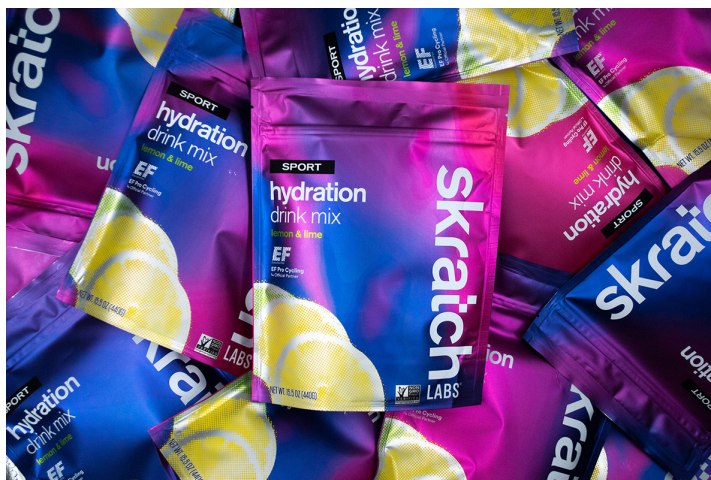
ePac created these award-winning pouches for a sports hydration company - based on the colors of the uniform of the cycling team. Created using HP Mosaic and printed on the HP Indigo 20000 Digital Press.

“ You can't just throw a finished RIP over the wall and hope it works with your customer's hardware. It is critical that Global Graphics involves HP as a partner in the design and delivery process. ”