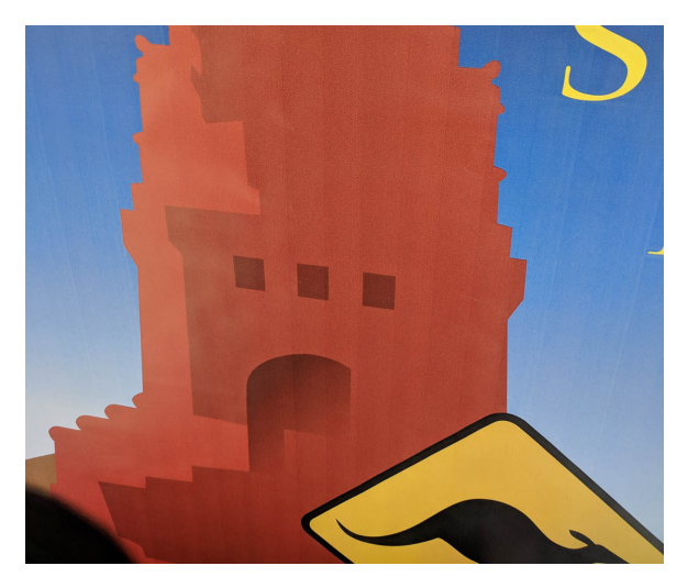
Banding problem on sensitive jobs

In ScreenPro every nozzle can be addressed separately on any head/electronics to achieve very fine granularity. PrintFlat adjusts the density within ScreenPro to produce uniform density across a print bar.