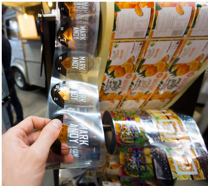
Fully variable printing: The Digital Series HD can print thousands of labels per minute, and each label can be different and at variable places on the web.

VDP jobs. As the Digital Series press was being developed, Mark Andy quickly realized that a highly capable RIP, hardware and software suite were required to process VDP jobs sufficiently fast to avoid press shut downs due to a lack of RIPped VDP work loaded on the digital press job queue.