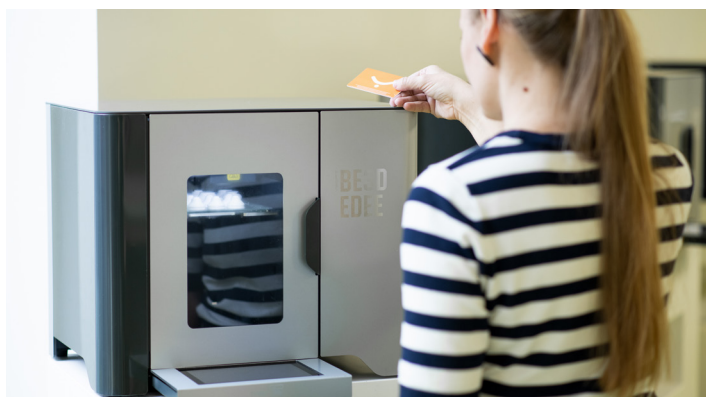
YSoft SAFEQ also offers 3D print management.